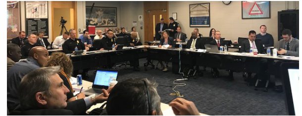
New Orleans and Milwaukee Partners During the PSP CompStat Peer Exchange

In November, the Milwaukee PD hosted a peer exchange with New Orleans to demonstrate the process and practices of Milwaukee's PSP CompStat meetings. Milwaukee's involvement in PSP has been unique in that local leadership concentrated its PSP resources and efforts in smaller geographic areas with high crime rates within the city, first with the CSC and then to the Capital Drive East (CDE) area. In November 2017, the Milwaukee PD's then Chief Ed Flynn noted that in 2016, the CSC experienced significant reductions in violent crime in nine months of focused efforts, most notably a 28 percent reduction in the amount of nonfatal shootings. 19 The main goal of this peer exchange was for New Orleans' local and federal partners to learn how the Milwaukee PD effectively collaborates with its federal partners to take a focused approach to crime reduction in Milwaukee's high-crime areas. A number of representatives from the Milwaukee PD and its local federal partners attended the exchange. At the invitation of BJA's Director for Policy, Kristen Mahoney, DOJ's Associate Deputy Attorney General, Steven Cook, attended this peer exchange to learn more about PSP and to network with participants. Participants attended the Milwaukee PD's PSP CompStat meeting (held every six weeks), visited its Crime Gun Intelligence Center, and discussed challenges and successes.