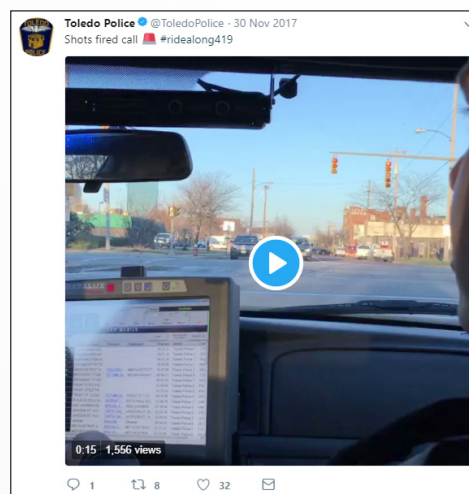
Toledo PD "Tweet-Along" Post

The Toledo PD continues to make officer visibility and engaging with the community a priority. The Toledo PD participated in the kick-off of a national "No More" campaign that seeks to end domestic violence and sexual assault by breaking down stigmas. The program encourages the public to educate themselves on resources available in the community and raise awareness around these issues. The Toledo PD reported in October that it had responded to 11,589 domestic violence-related calls so far in 2017. 33 The Toledo PD and other area law enforcement agencies took part in an annual countywide domestic violence sweep this quarter in which 31 arrests were made. 34 Gang violence is an issue for the city—in 42 percent of the murders in 2017, the victims or killers were gang members. 35 To help address the issue, four more officers were added to the gang task force. The Toledo PD held two "tweet-alongs" (virtual ride-alongs) this quarter, providing the public with an idea of patrol officers' and gang task force detectives' daily experiences. In addition to connecting with the community, these virtual ride-alongs are a tool to help recruit those who might be interested in a career in law enforcement. The Toledo PD hosted several "Coffee With A Cop" meetings this quarter, bringing officers and the community members they serve together to discuss issues and learn more about one another. 36 The Toledo PD also held a free public forum in November,