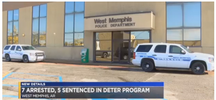
News Program Reports on Some of the Successes of Operation DETER

The culture of the West Memphis PD has become more data-driven and community outreach-focused throughout its engagement in PSP. The West Memphis PD's Operation DETER program is a targeted tactical enforcement effort that concentrates on repeat criminals and violent neighborhoods that cause disruptions in the community. The program is modeled on the Los Angeles PD's Operation LASER, which the West Memphis PD learned about during a PSP peer exchange. Operation DETER was launched in February 2017, and in November 2017, the West Memphis PD reported a 16 percent crime reduction over time in one of its DETER neighborhoods. 39