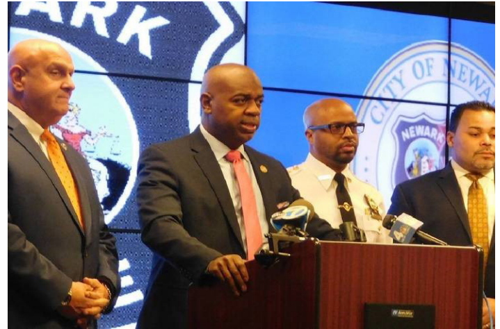
Newark Mayor Ras Baraka and Public Safety Director Anthony Ambrose Announce 2017 Crime Statistics

Between April and December 2017, law enforcement partners in Newark recovered 125 guns and confiscated 18,431 decks of heroin, 6,931 vials of cocaine, 2,801 plastic bags of marijuana, and 2,205 assorted pills in an ongoing citywide narcotics and guns operation. 30 As part of the site's larger strategy to target gun violence and advance public safety, Newark has established an informal gun case management process. The process helps determine whether a defendant is more likely to get a higher sentence if federally prosecuted and outlines a process for adoption of these cases by the appropriate prosecutorial office, either the USAO—District of New Jersey (USAO—NJ) or the Essex County Prosecutor's Office (ECPO). This review process has contributed to a decrease in the time from arrest to charging in most cases and an increase in communication between the USAO—NJ and the ECPO. To ensure that these successes and improved workflow continue, the site is working on formalizing processes and reinforcing the support and compliance of the contributing local and federal partners. The Newark PD has succeeded in addressing all but one of the recommendations from BJA's previously conducted technology assessment and has hired an IT director, who will explore ways to address technology and countywide issues.