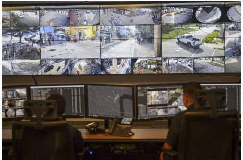
New Orleans' RTCC

The New Orleans PD and its federal partners have identified two geographical areas that have been historically violent for PSP target area enforcement to reduce firearm-related violence, similar to Milwaukee's CSC model. As part of this effort, the New Orleans PD's community liaison officers will increase engagement in community meetings, churches, and other groups to improve community relationships and will conduct more walking beats in the areas. The FBI will work with the New Orleans PD to identify and actively prioritize violent offenders and their associates, and the FBI's gang task force plans to actively conduct investigations targeting top offenders in these areas. ATF will continue to provide NIBIN and eTrace support to the New Orleans PD, prioritize the analysis of evidence from the target areas, and focus on felon-in-possession-of-a-firearm investigations in the area and tracing gun purchases. DEA will help identify violent offenders involved in the drug trade and actively conduct narcotics investigations focusing on known violent offenders. USMS will prioritize the locating and apprehending of violent fugitives in target areas, and the USAO—EDLA and the Orleans Parish District Attorney's Office will prioritize violent crime prosecutions in the target areas and flag associated gun cases.