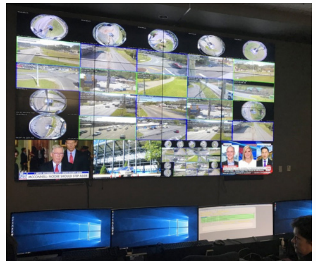
View of the MACC

The USAO—NDAL has established an improved process to review and refer gun cases to determine the best prosecutorial venue (federal or state) for gun cases. Because gun crime continues to be of particular concern in Birmingham's public housing communities, officials with the USAO—NDAL, ATF, and the Jefferson County District Attorney's Office hosted a training seminar for Birmingham PD officers who patrol these communities that focused on how to pursue federal gun charges. 1 Charging offenders at the federal level usually permits a more timely and severe resolution, making it less likely that repeat offenders will return to the community and continue to contribute to the violence.