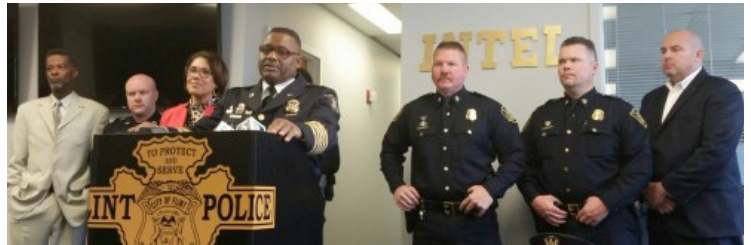
Flint PD Announces the Creation of the Flint Police Intelligence Operations Center

In November, the Flint PD announced the creation of the Flint Police Intelligence Operations Center. The intelligence center allows the Flint PD to view live footage from a network of cameras to analyze crime trends and inform optimal deployment of its resources. The center is part of the Flint PD's larger strategic plan to reduce response times and is staffed by uniformed and reserve police officers and a crime analyst.