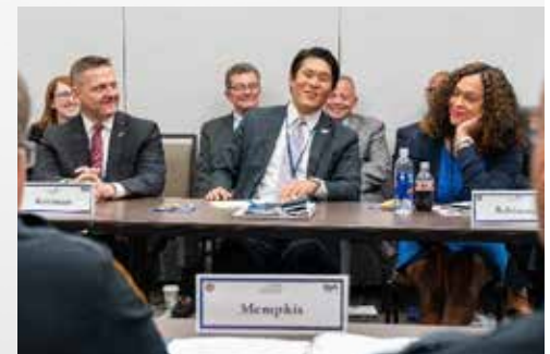
Attendees from PSP sites Baltimore and Memphis share lessons learned in fighting crime during the site-pairing networking session